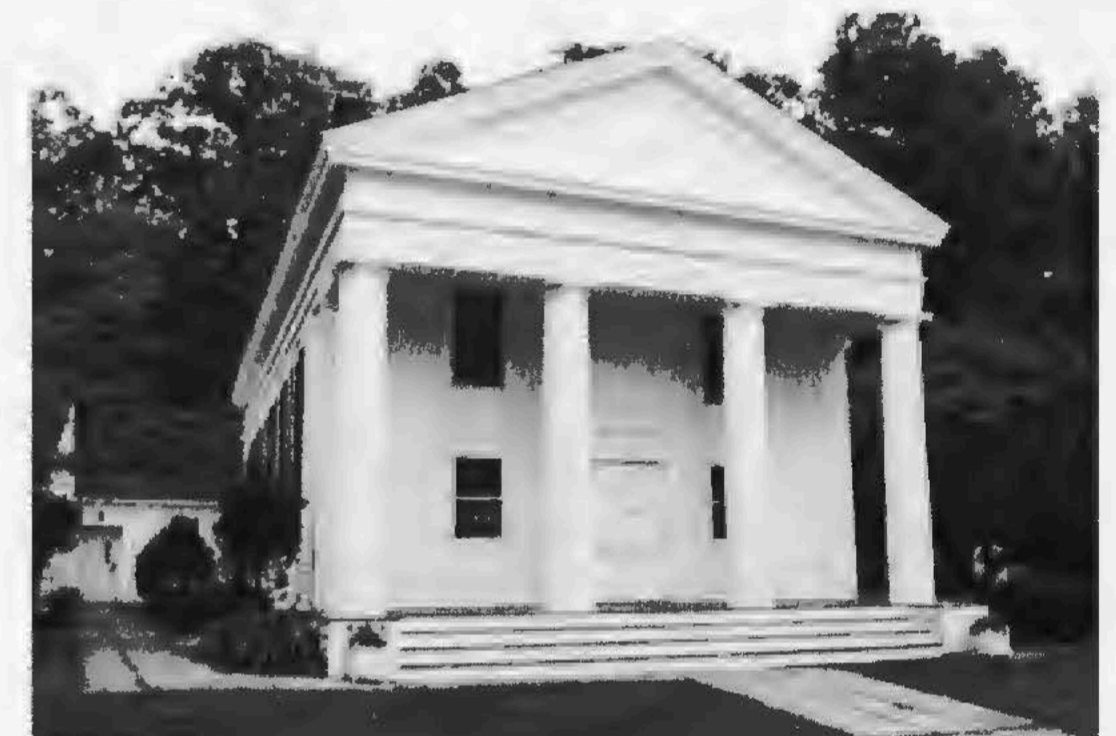
PLEASANT PLAINS PRESBYTERIAN CHURCH, Clinton Greek Revival

Pre-ordered box lunches may be picked up at The Ambrose Wager House (Tour Center), and we encourage you to enjoy them on the grounds of Wilderstein. Discounted tours at Wilderstein may be purchased separately. Please see the order form on the reverse side of this brochure.