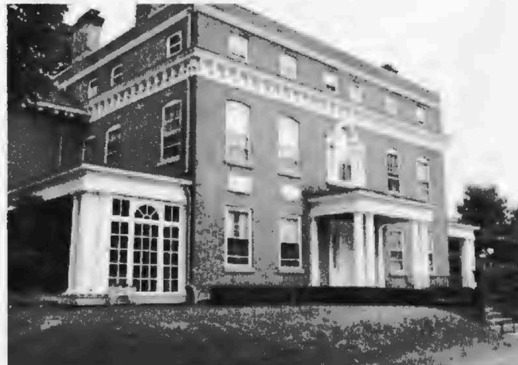
MAIZELAND, Red Hook Federal