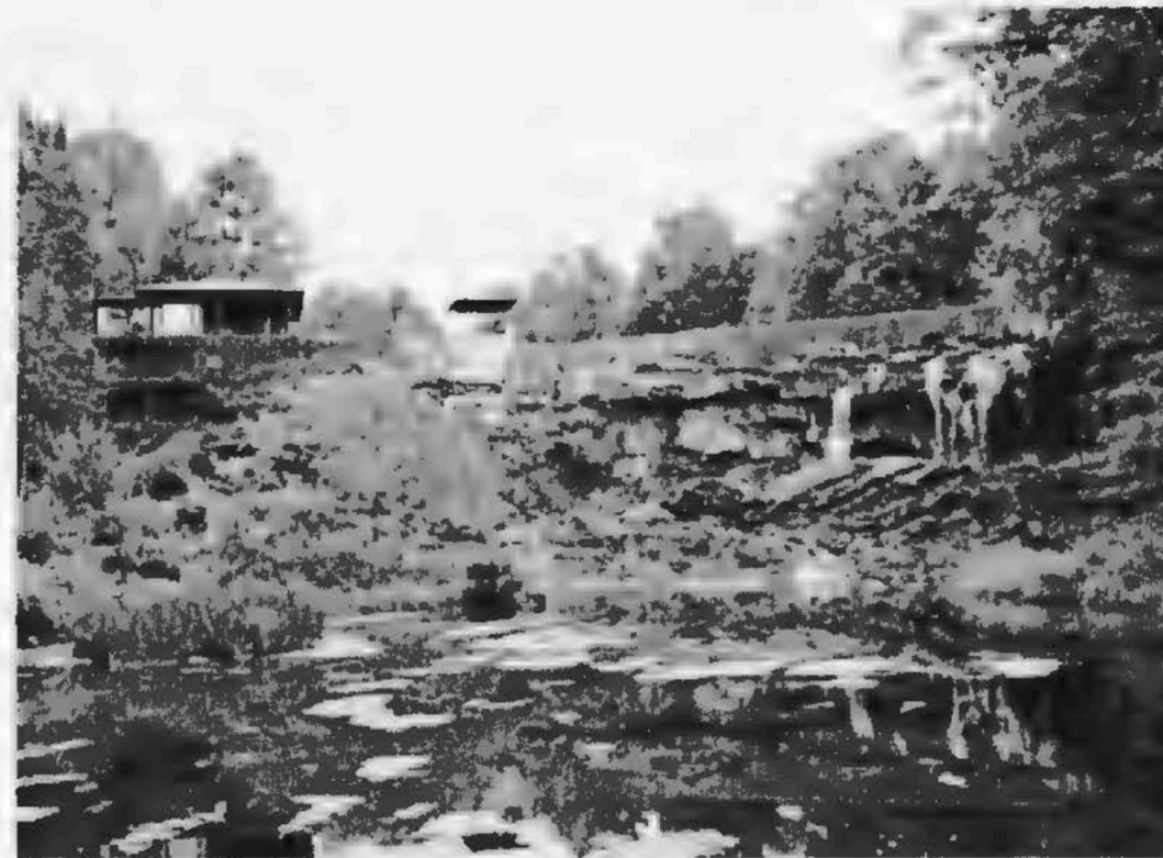
STEVEN MENSCH HOUSE, Rhinebeck Contemporary/Modern