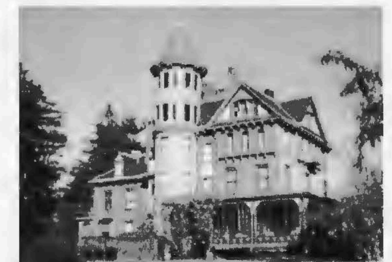
WILDERSTEIN, Rhinebeck Queen Anne

Pre-ordered box lunches may be picked up at The Ambrose Wager House (Tour Center), and we encourage you to enjoy them on the grounds of Wilderstein. Discounted tours at Wilderstein may be purchased separately. Please see the order form on the reverse side of this brochure.