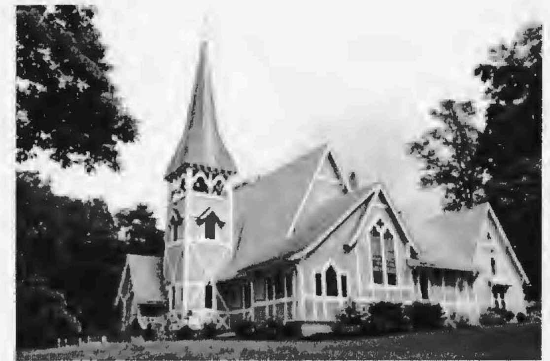
ST. JOHN THE EVANGELIST CHURCH, Barrytown Gothic Revival