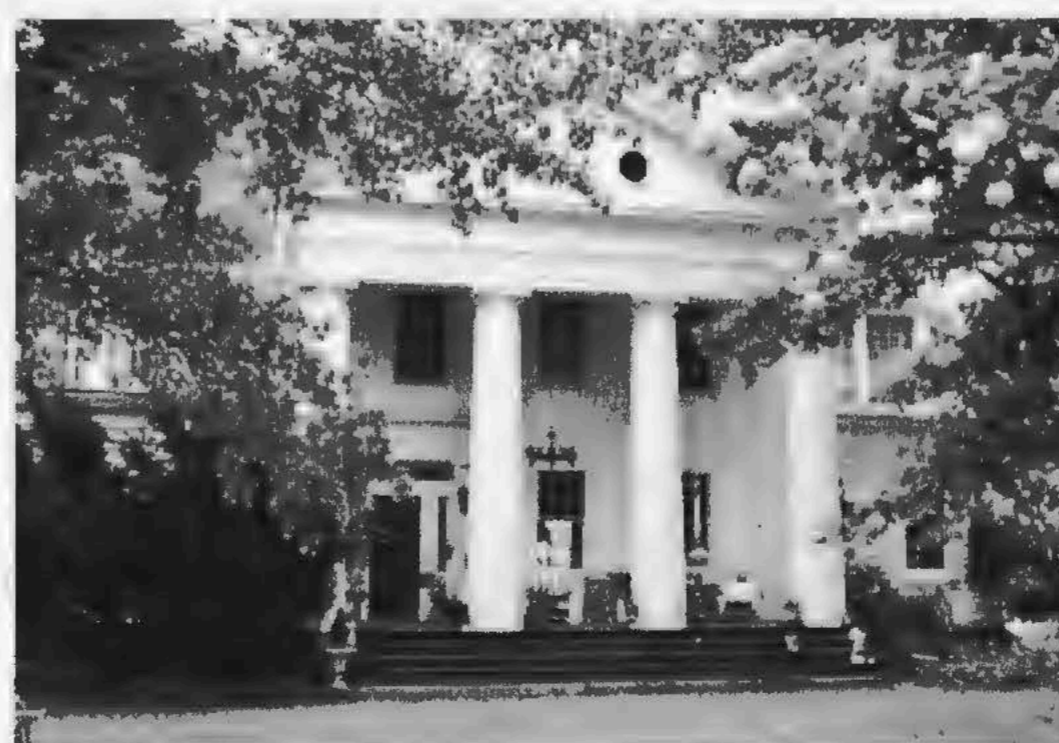
HENRY STAATS HOUSE, Rhinebeck Greek Revival