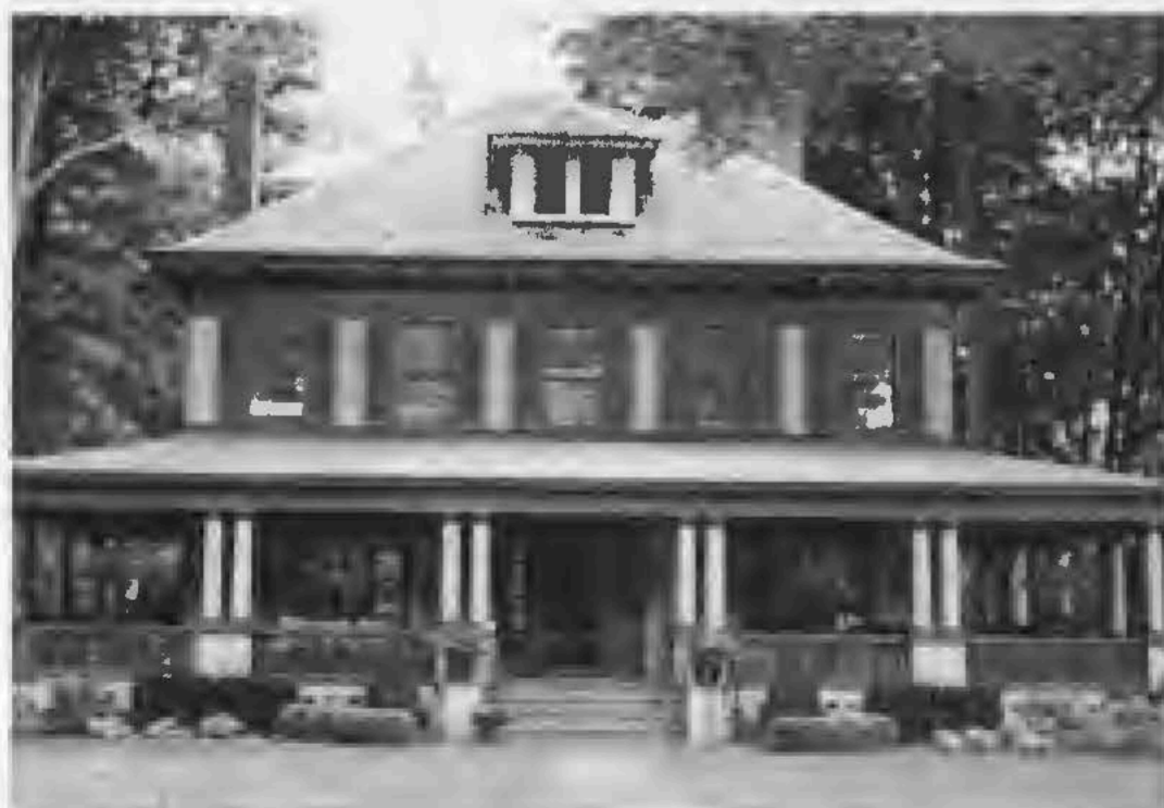
BENSON FROST HOUSE, Rhinebeck Colonial Revival